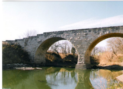
Clements Stone Arch Bridge. Post-HTF project. 03/2008.