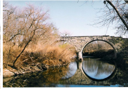
Clements Stone Arch Bridge. Post-HTF project. 03/2008.