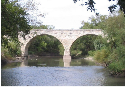
Clements Stone Arch Bridge. Post-HTF project. 03/2008.