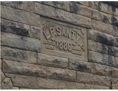
Clements Stone Arch Bridge