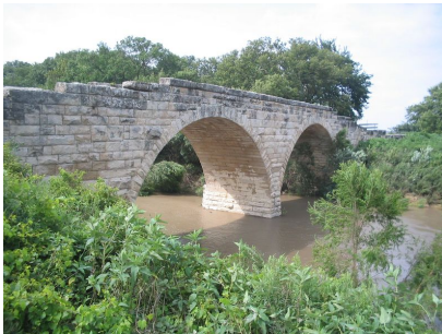
Clements Stone Arch Bridge. Post-HTF project. 03/2008.