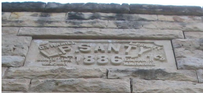
Clements Stone Arch Bridge. Post-HTF project. 03/2008.