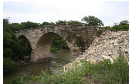
Clements Stone Arch Bridge. Damage to bridge. 09/2009.