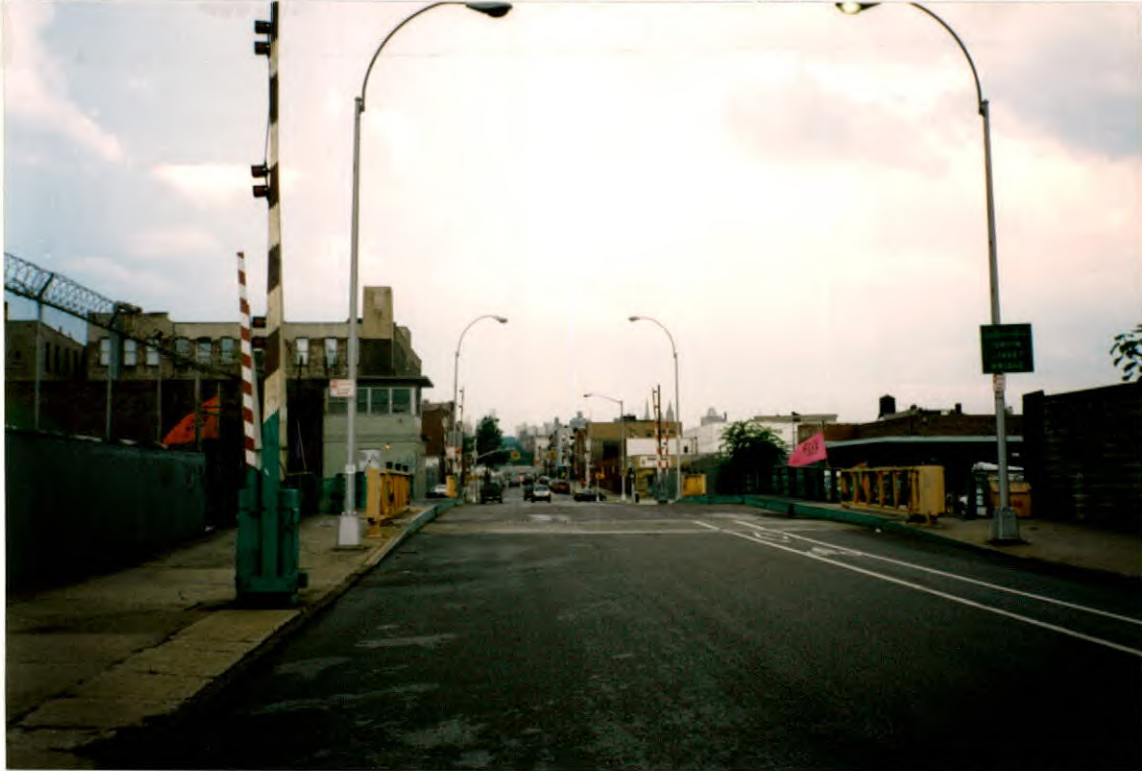
VIEW LOOKING East PHOTO NO. 3 DESCRIPTION Union Street Bridge over Gowanus Canal- top of bridge (BIN # 2-24027-0)