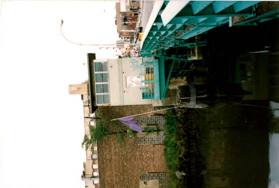
VIEW LOOKING East PHOTO NO. 4 DESCRIPTION Union Street Bridge over Gowanus Canal- operator house (BIN # 2-24027-0)