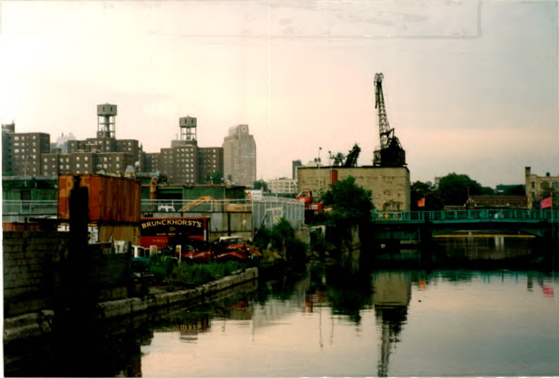
VIEW LOOKING North DESCRIPTION Union Street Bridge over Gowanus Canal- south elevation (BIN # 2-24027-0)