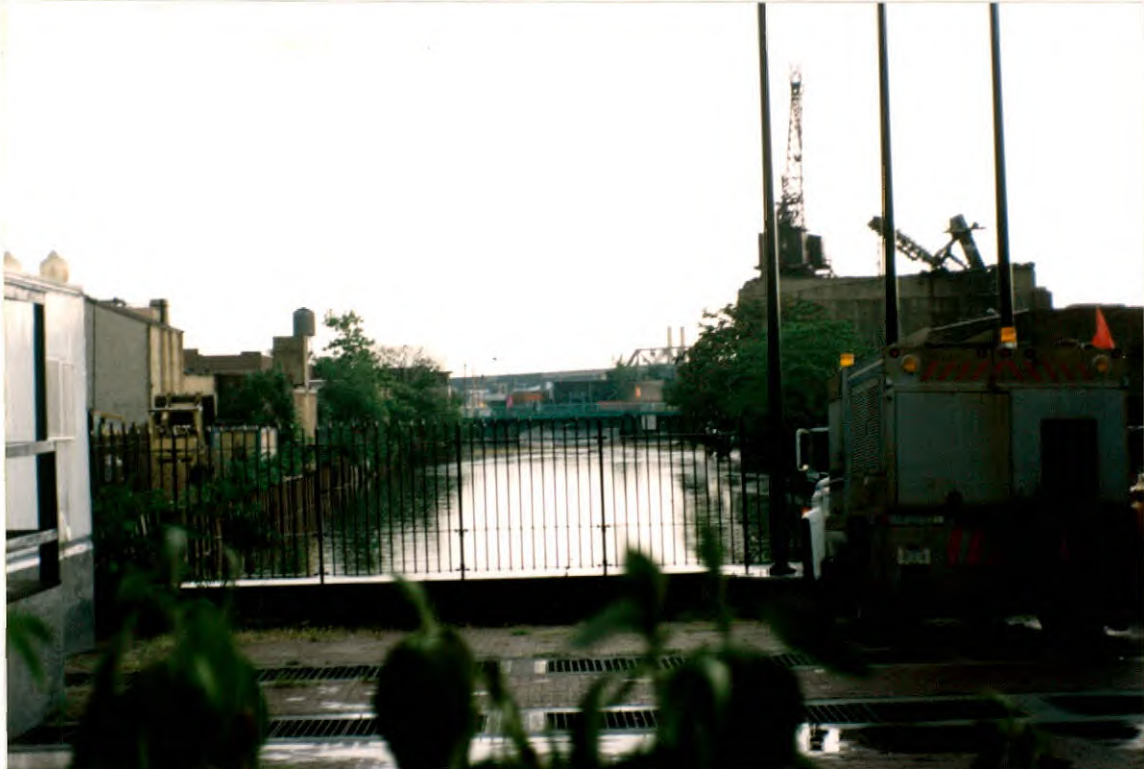
VIEW LOOKING South PHOTO NO. 5 DESCRIPTION Union Street Bridge over Gowanus Canal- north elevation (BIN # 2-24027-0)