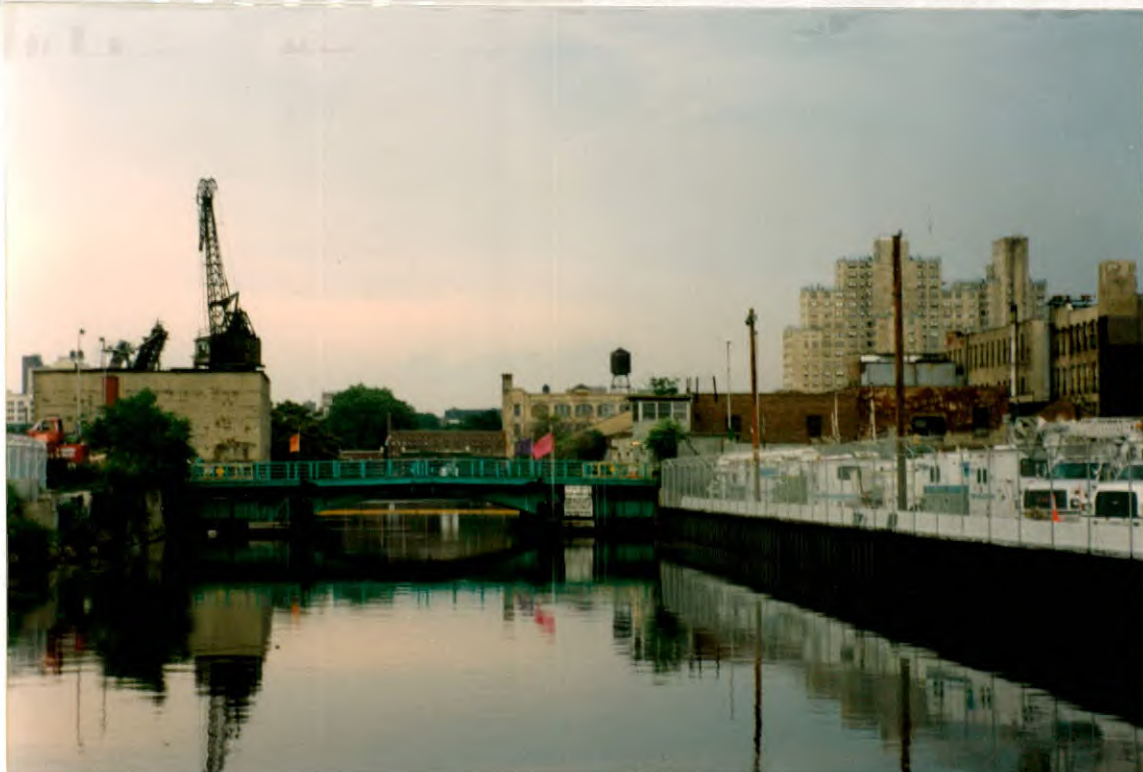
VIEW LOOKING North DESCRIPTION Union Street Bridge over Gowanus Canal- south elevation (BIN # 2-24027-0)